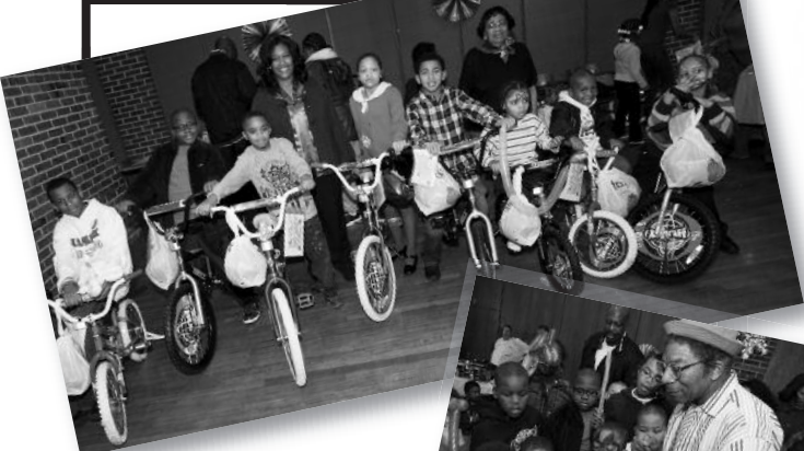
Above Left: This year, the children were entertained by the Spiral Q puppet theatre, Mlanjeni's Magic, face painting and Santa.